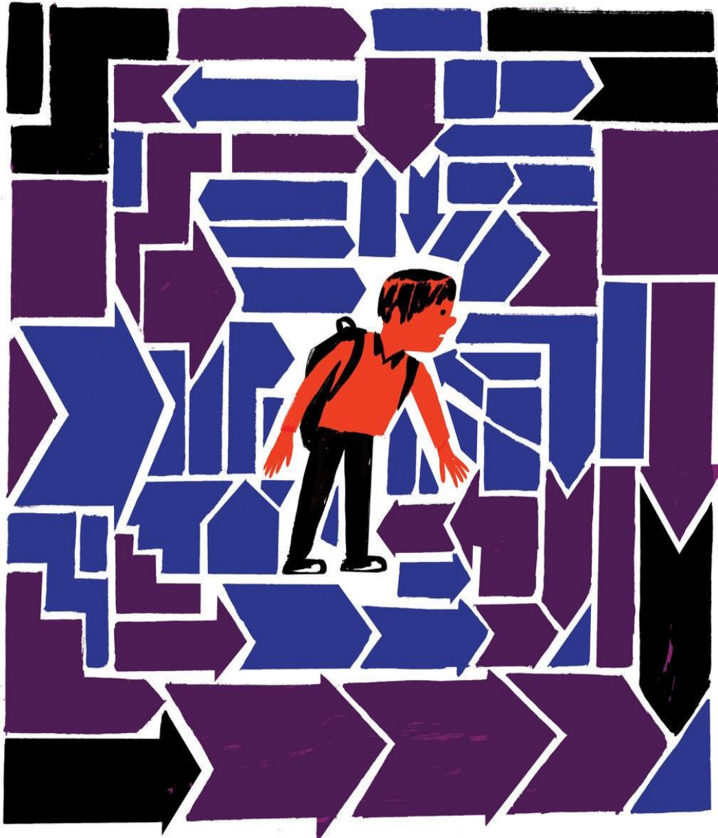
Illustration by Joao Fazenda