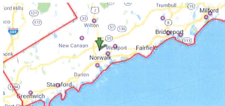
Figure 12: MAT in Southwest CT

beds. The state Access Line, which provides transportation to detoxes when needed, is reported to be less able to connect people to treatment than in the past.